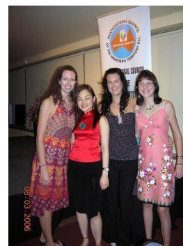
This year IWD Dinner was held at Kantillas Function Centre in Marrara Oval.

The Multicultural Council of the NT (MCNT) has been organising IWD's dinner for the past ten years. The MCNT Committee believes that we need to celebrate and acknowledge women's contributions to society. There were 100 people who turned up for the celebration dinner.