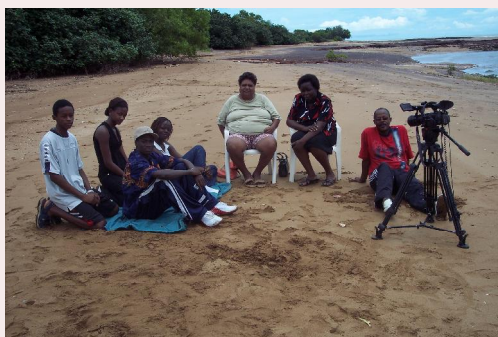
filming a sequence on Larrakia culture at Rapid Creek

One to one training is still taking place with a few cultural groups who are yet to complete their Power Point presentations and we are expecting to start public speaking training in a month. The settlement video's filming stage is almost completed. The technical and acting team has so far involved 12 people from several African communities, with a strong youth focus and participation.