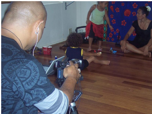
AT TRACKS DANCE REHEARSAL SPACE TO VIDEO THE GRAY FAMILY