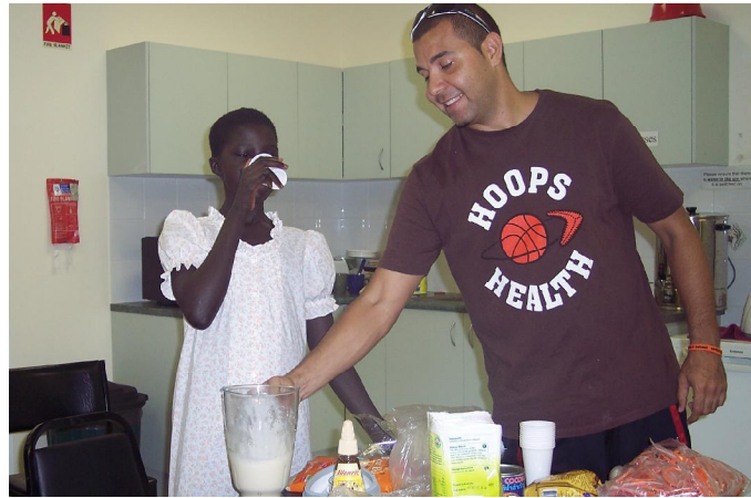
The participants were given slide shows, talk-ups, ball handling tricks, tips on eating healthy and three days of basketball. A portable hoop was set up at the car park behind the MCNT office