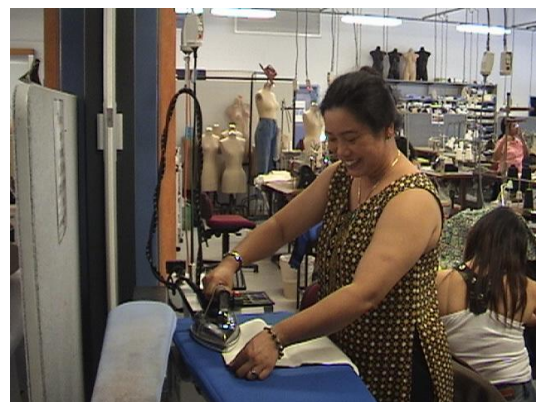
Ladies at work