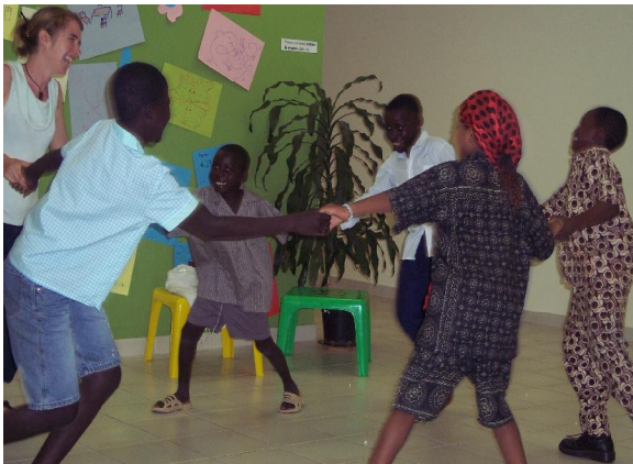
Sing, Dance And Feel Good