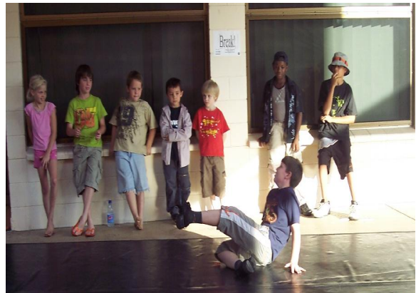
Break Dance Competition